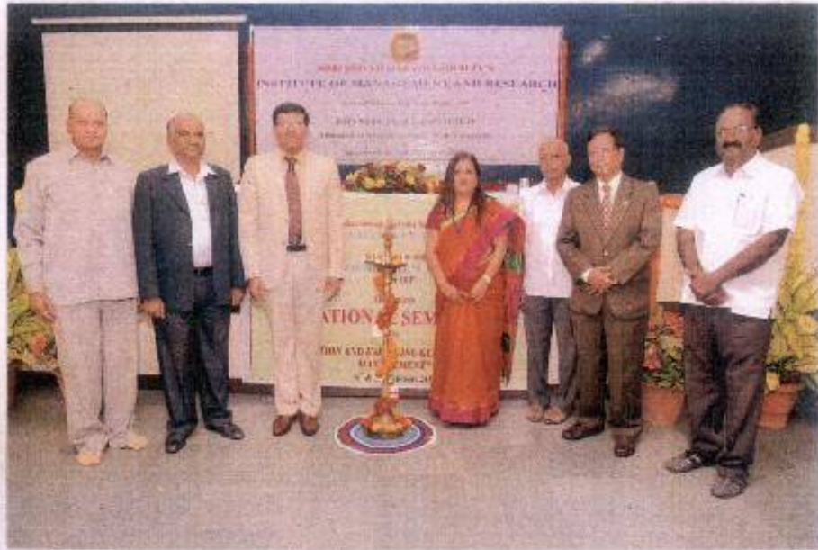
Inauguration of the Seminar