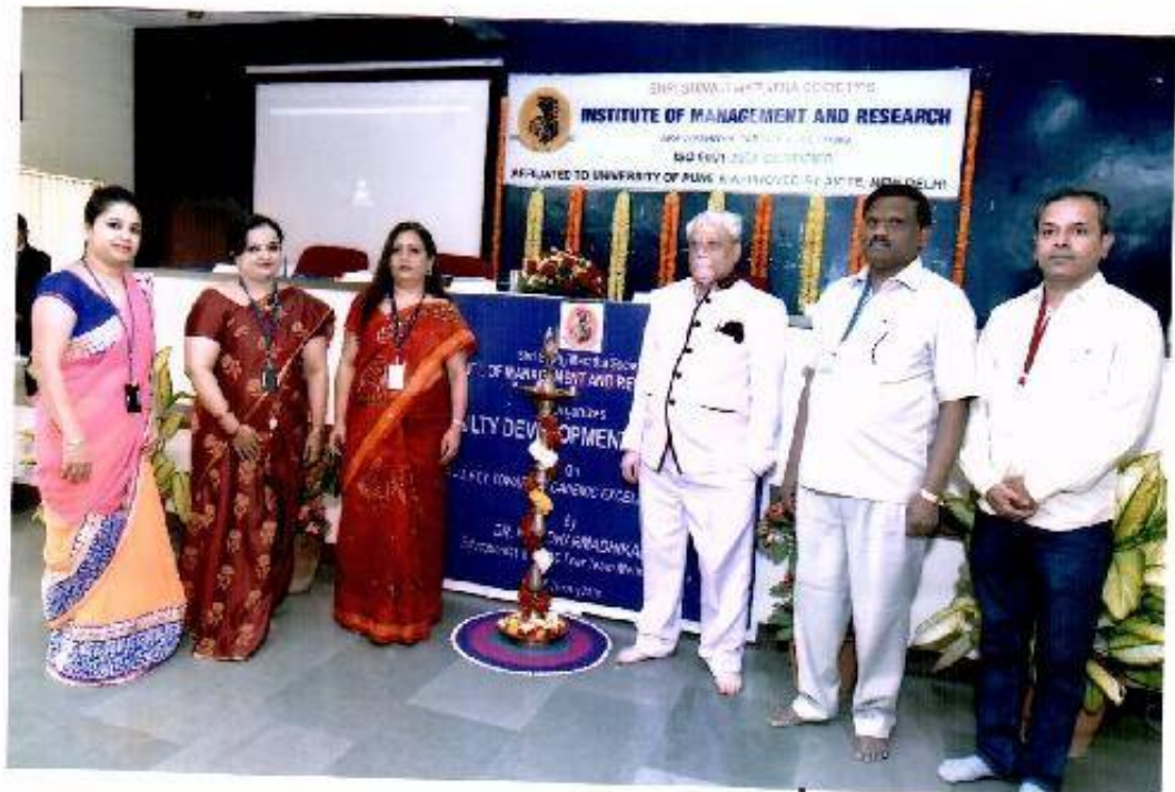
LIGHTENING OF LAMP