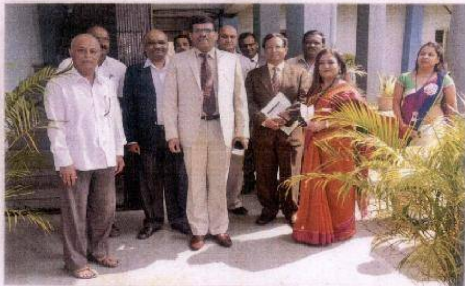
Arrival of Guests and Resource persons