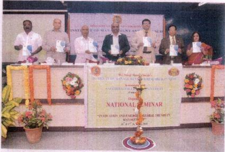
Unveiling of Research Publication, "Anveshan"