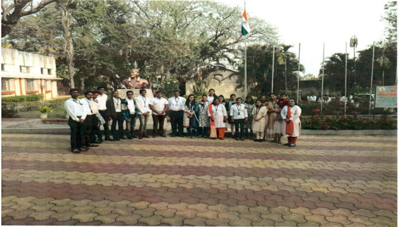
Students and staff participation and their presence for Independence Day

Office: 11/101, P. B. No. 1, Shivajinagar, Pune-411009 E-mail: shri Shivaji Maratha Society's Institute of Management & Research