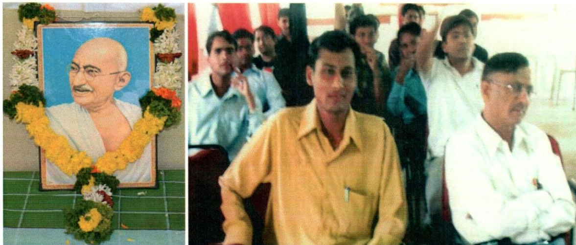
Students taking oath on "Truth and Non-violence"

Shri Shivaji Maratha Society's IMR institute celebrates Gandhi Jayanti as a national festival which is the birth anniversary of Mohandas Karamchand Gandhi born on 2 nd October 1869 who is known as Father of our nation. It is celebrated every year on the next day of 2 nd October at IMR campus. He was a freedom fighter and spiritual leader of India and played a key role in the Indian independence movement. We convey the thought process of Gandhi about nonviolence, Satyagraha (Truth Movement), and ahimsa to our students and staff through speeches and peace rally.