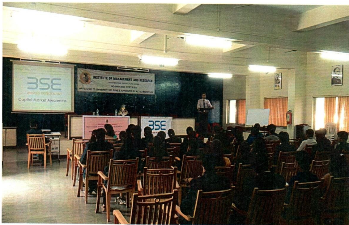
MBA I year student giving Presentation (LCD Projector)