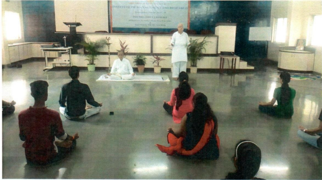
Yoga & Meditation