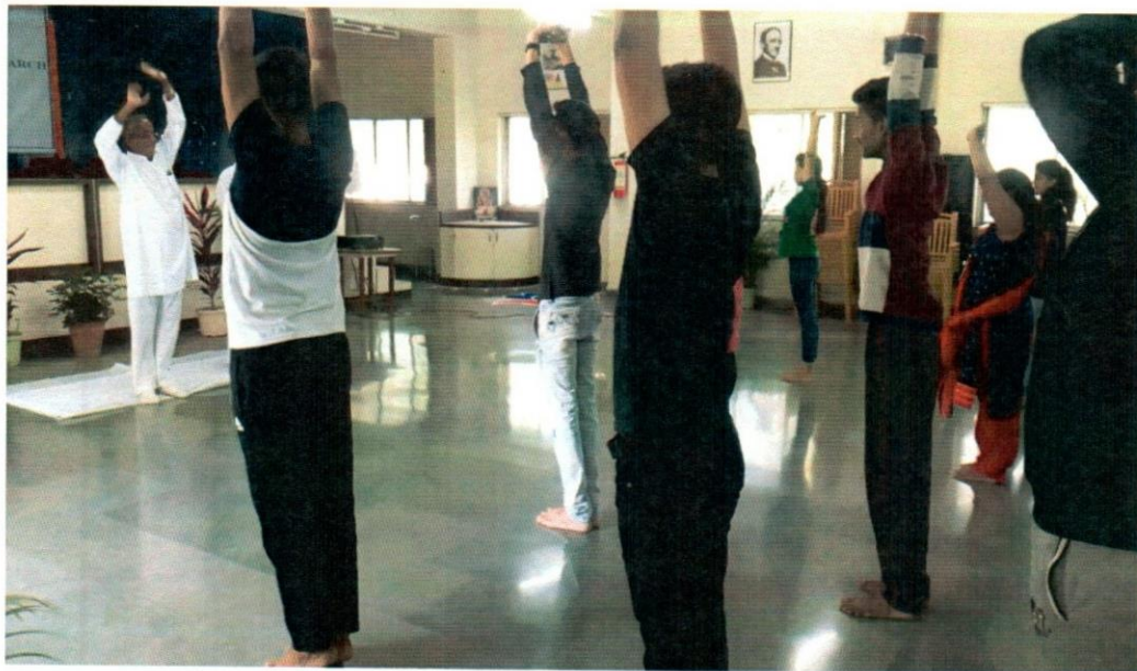
Yoga & Meditation