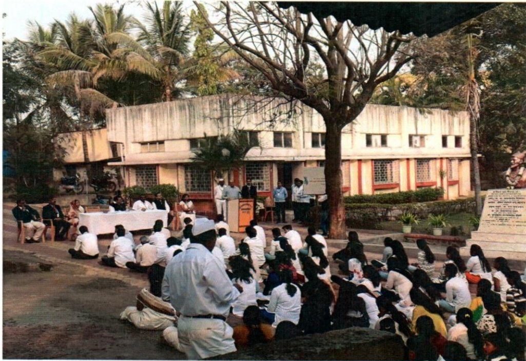
26 th January Republic Day Celebration