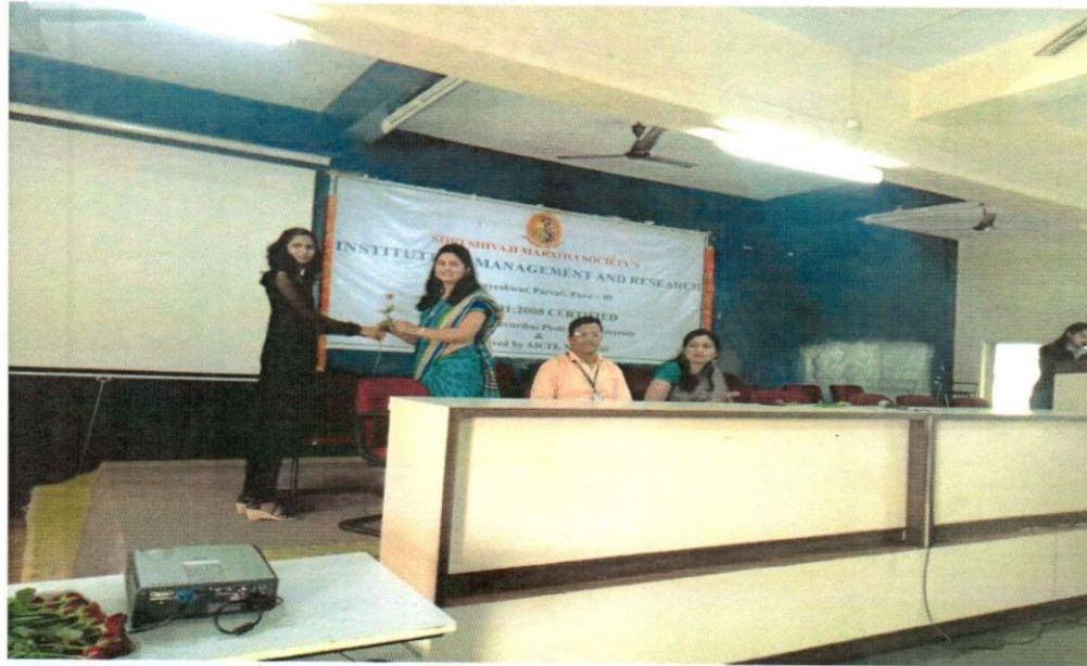
Teachers Day Celebration