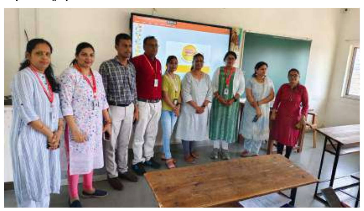
Faculty members along with Trainer