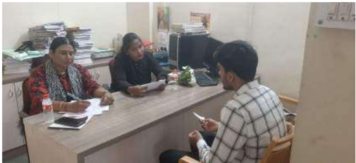
Valedictory Session-Certificate Award